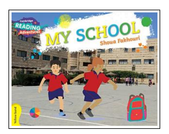
Filesize: 4.66 MB