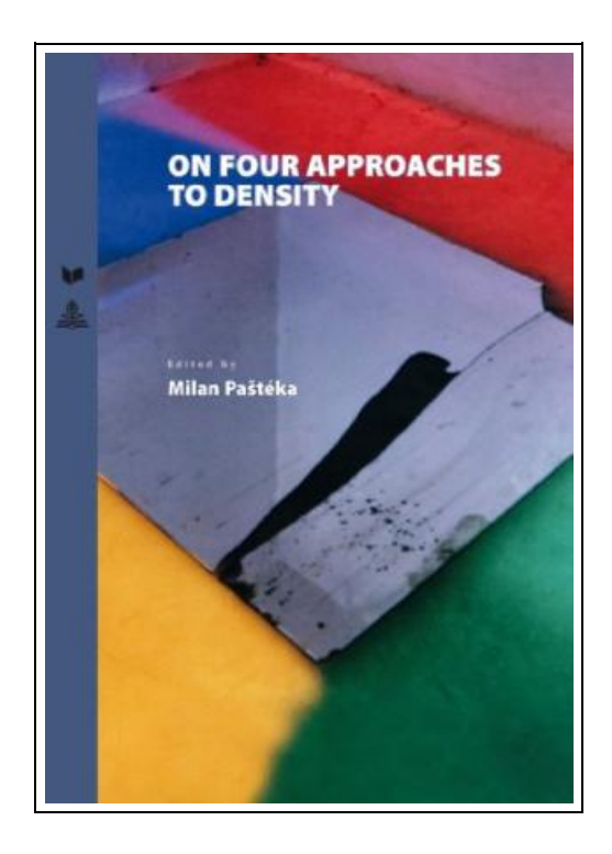
Filesize: 1.61 MB