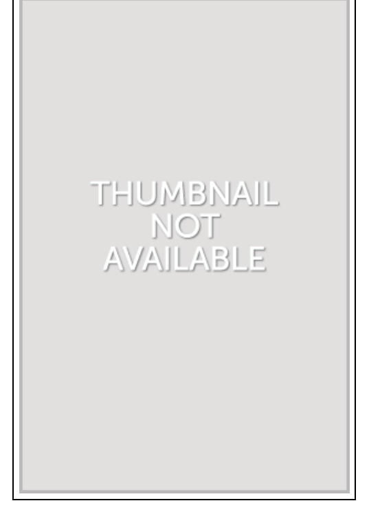
Filesize: 6.1 MB