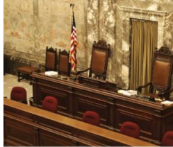
Highlights of a GAO Forum: Global Competitiveness: Implications for the Nation's Higher Education System: GAO-07-135SP