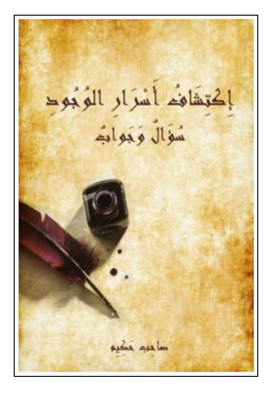
Filesize: 8.15 MB