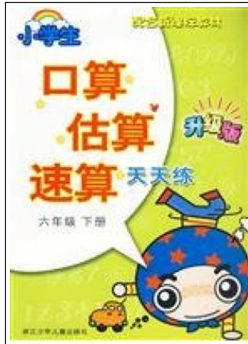
Filesize: 2.19 MB