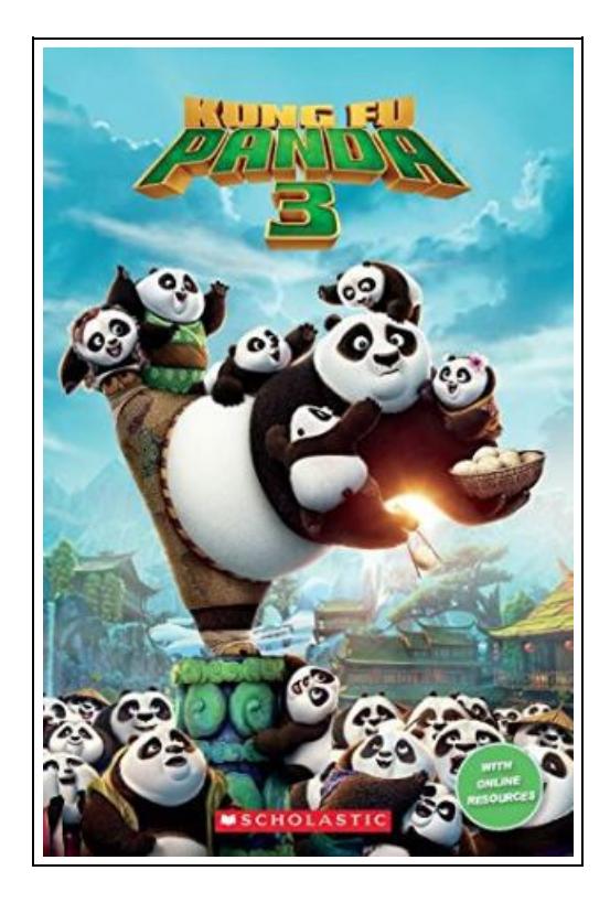
Filesize: 1.41 MB