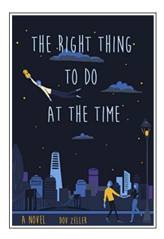
Filesize: 4.29 MB