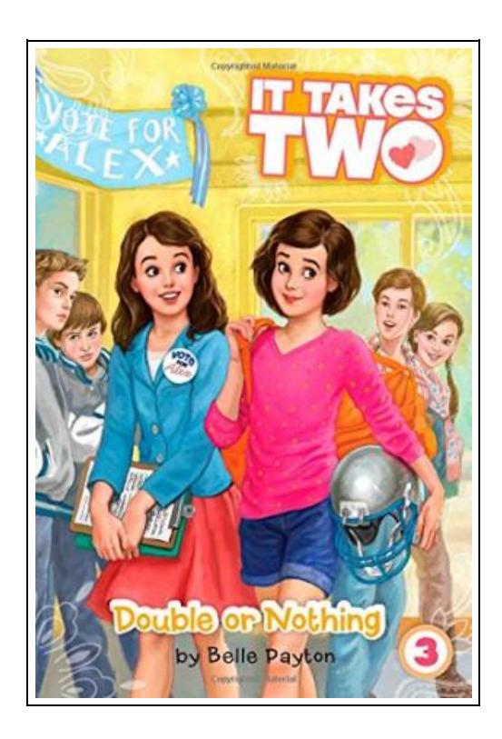
Filesize: 8.97 MB