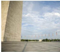
Research and Technology 2004