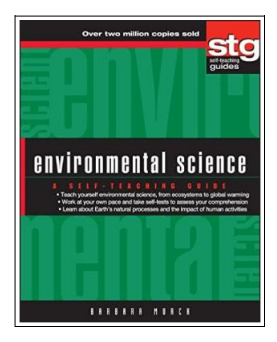
Filesize: 2.81 MB