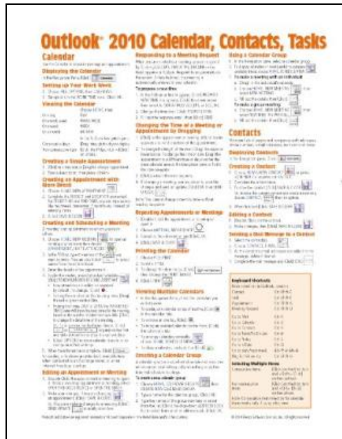
Filesize: 3.12 MB