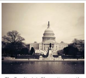
The Results Act: Observations on the Department of State's May 1997 Draft Strategic Plan: NSIAD-97-198R

U.S. Government Accountability Office (GAO)