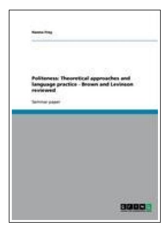
Filesize: 1.19 MB