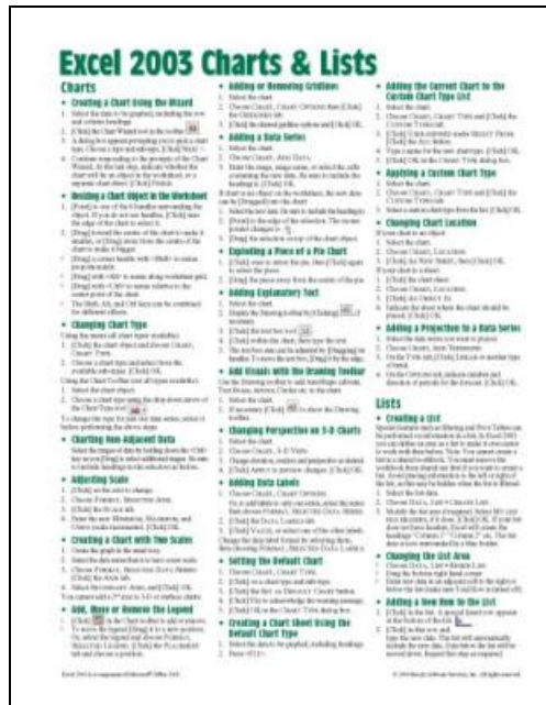
Filesize: 3.13 MB