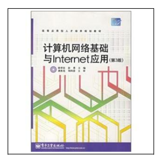
Filesize: 4.26 MB