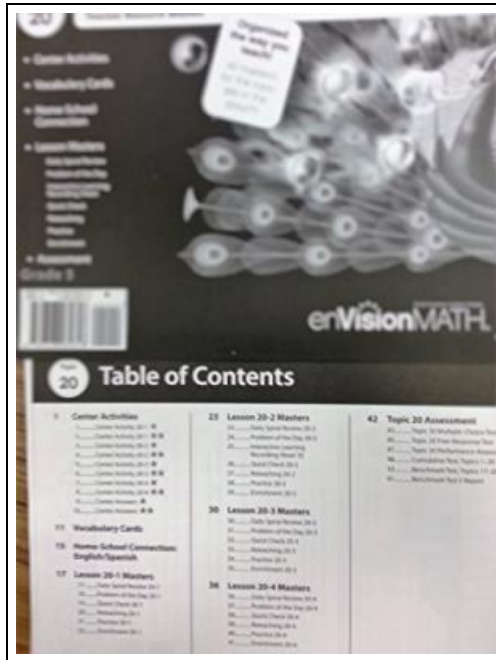
Filesize: 7.87 MB