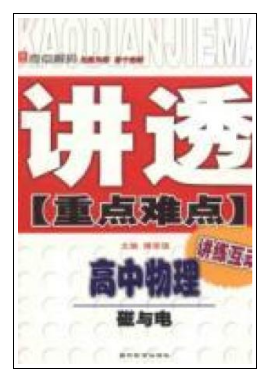
Filesize: 5.43 MB