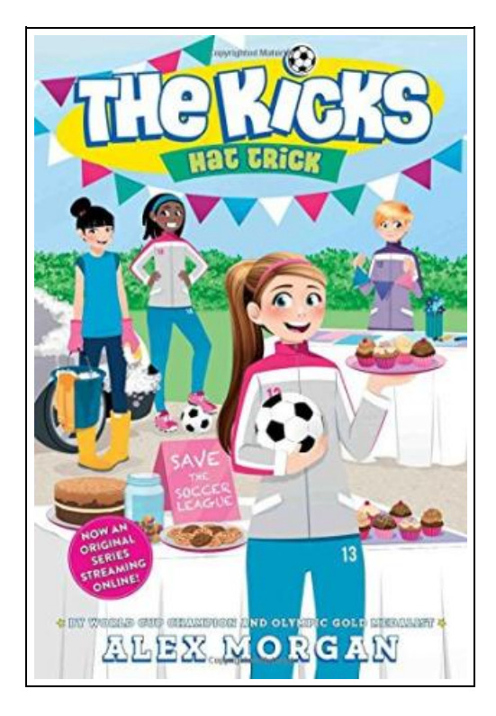
Filesize: 4.29 MB