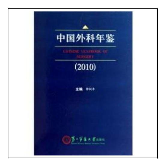
Filesize: 6.6 MB