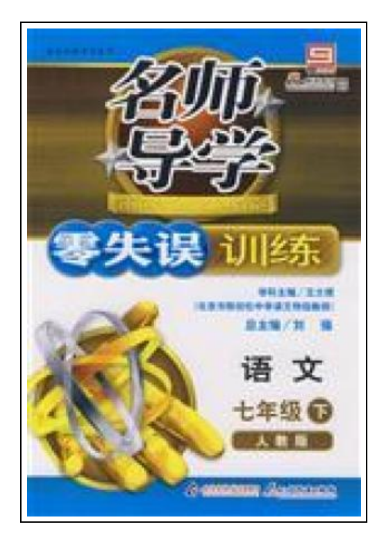
Filesize: 4.86 MB