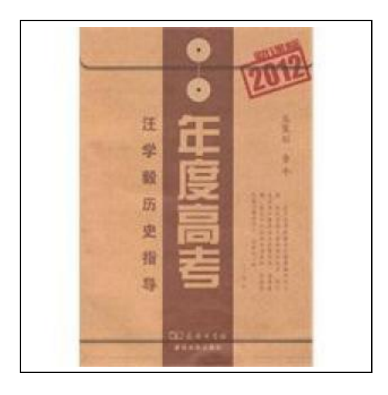
Filesize: 3 MB